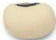
Black Eye (Cow Pea)