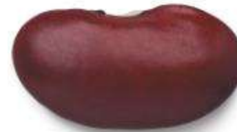
Dark Red Kidney