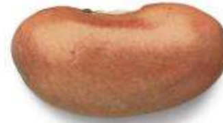
Light Red Kidney