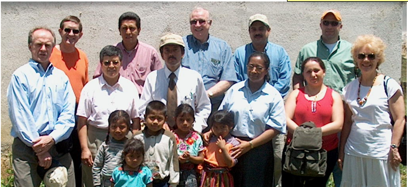
Soybean leaders went to Guatemala to see soy feed the hungry while it promotes business.